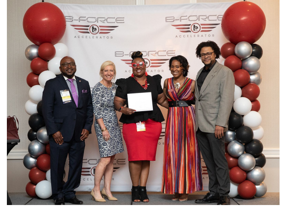
Black BRAND's B-Force Accelerator