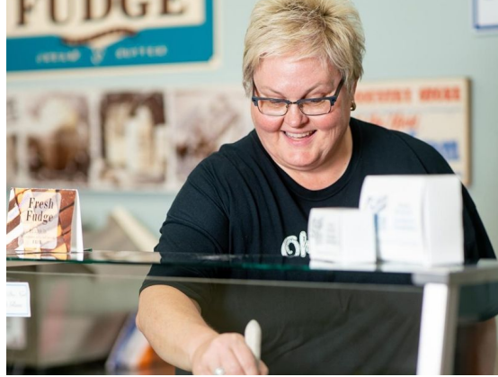
The City of Bristol's Made in Bristol