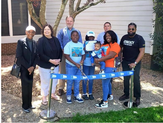
Inner Peace Coalition's Childcare Business Support